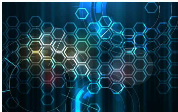
Figure 1: Insert caption to place caption below figure (Century Gothic 10)